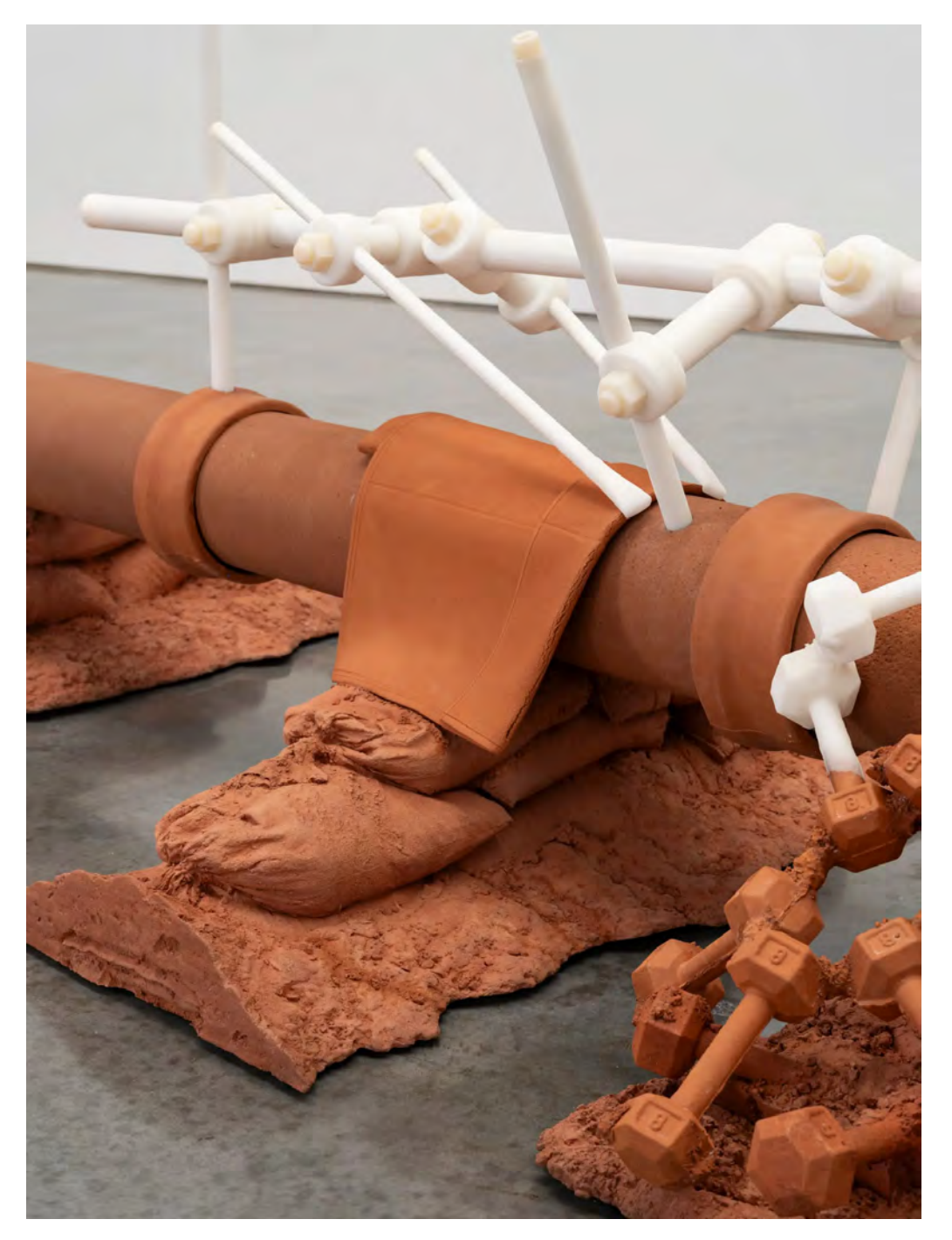
A detail of "Supine Axis." The fragile red clay, fired in Barney's studio as part of the research process of "Secondary," is held together by plastic.

The "Secondary" project is currently the subject of a major show at the Cartier Foundation in Paris. Here in New York, at Gladstone Gallery for a few more days, an exhibition of related sculptures and videos reveals the freer Barney you may have missed.